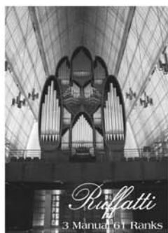
Ruffatti 3 Manual 61 Ranks Fratelli Ruffatti Pipe Organs Padua, Italy

New 4 Manual Console to be interfaced with 45 Rank Casavant Pipe Organ at Sligo Seventh Day Adventist Church Takoma Park, Maryland